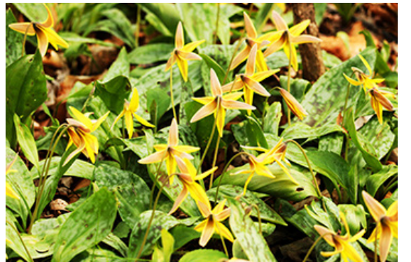
Three photos of trout lilies in the Seminary Woods