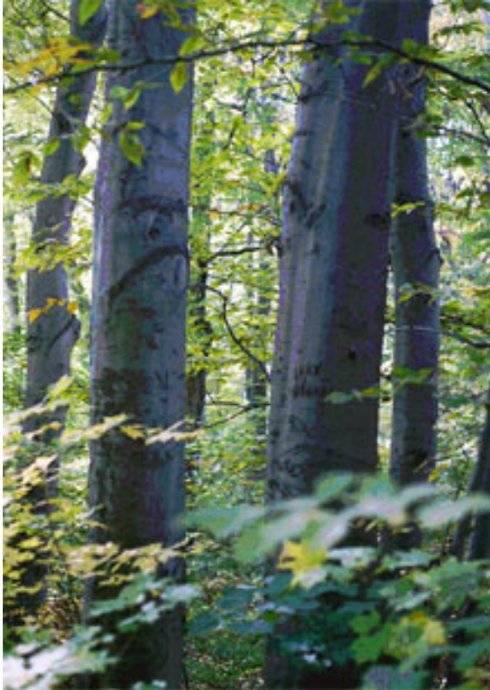
Beech trees dominate the Seminary Woods.

As for the wood violets, well, I did not find any in the woods this time. Maybe they were there, and I just didn't see them. Or maybe they were snuffed out by the Trout Lilies. I do not know. But to my surprise, at my childhood home which my brother now owns and abuts the woods, the backyard was covered in the purple wood violets. No, they were not creeping charlie weeds! They were the true wood violets. How they began to grow there, I'll never know. Maybe they were saying that they were still there for me. Nature has a strange way, you know. Either way, it sure was a pretty sight! I look forward to this spring and all the magic it has to offer. Zero degree weather, you can leave anytime now. I'll welcome spring!